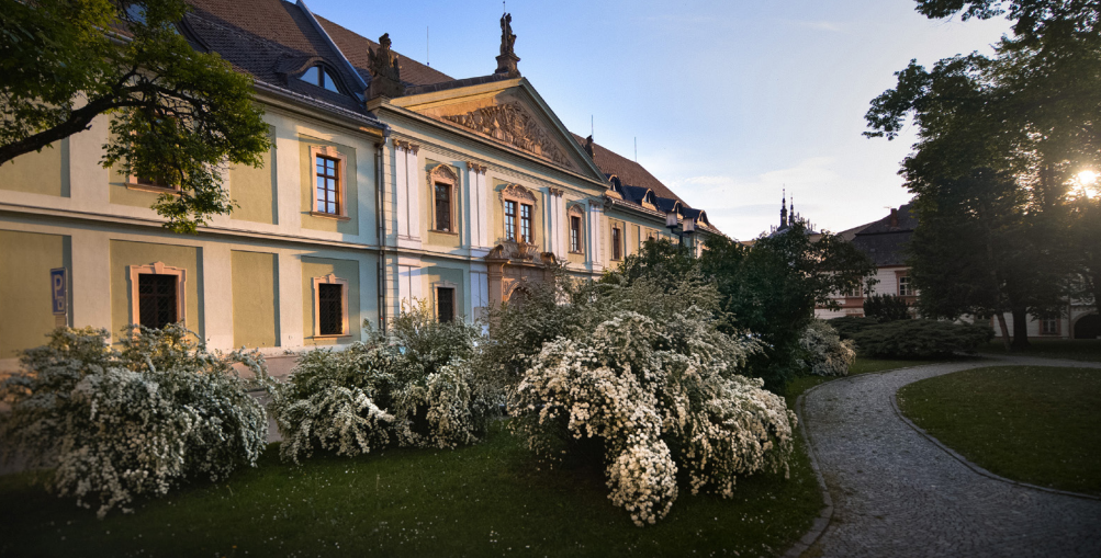
Zbrojnice UP ↑

the student and academic environment and institutions providing help to people who need it.