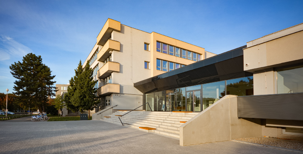
Faculty of Law – Building B ↑