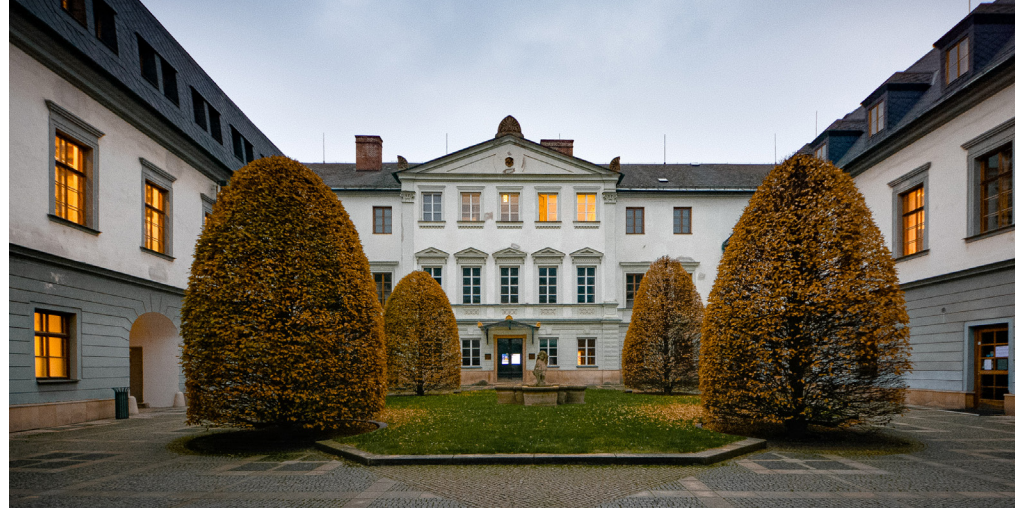
↑ UP Rectorate

Part-time PhD students typically don't have assigned offices but may have access to a workplace depending on their specific program.