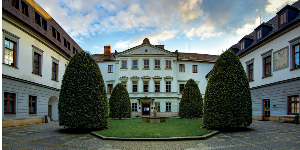
↑ UP Rectorate