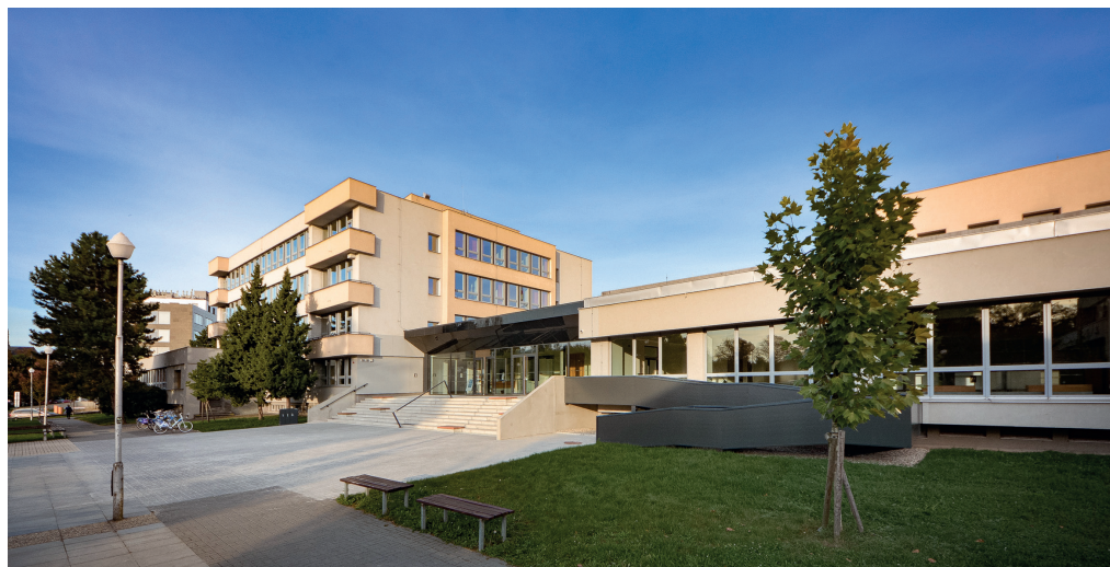
↓ Faculty of Law, building B